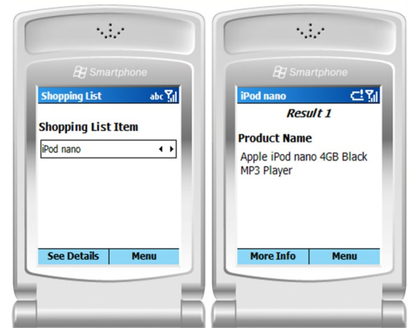
Figure 5. The main screen of the Shopping List Application (left), along with some more product details (right). Users can also choose to view price comparisons and reviews.

Figure 4. The main screen of the Directions Application (left). A step in the directions, along with the option to play synthesized speech of the directions (right)