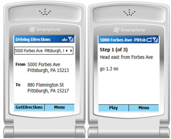
Figure 4. The main screen of the Directions Application (left). A step in the directions, along with the option to play synthesized speech of the directions (right)