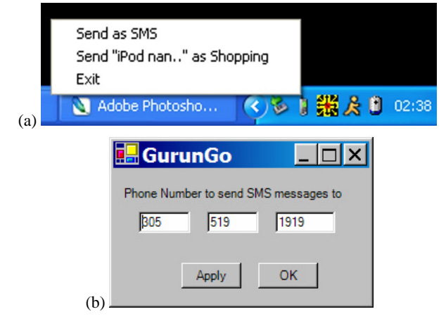
Figure 3. (a) A user pasting the item "iPod nano" onto the GurunGo annotator. (b) The screen used to input the phone number to send SMS messages to.

GurunGo also lets users send copied snippets as plain text over SMS if it is less than 160 characters (see Figure 3b). We opted to