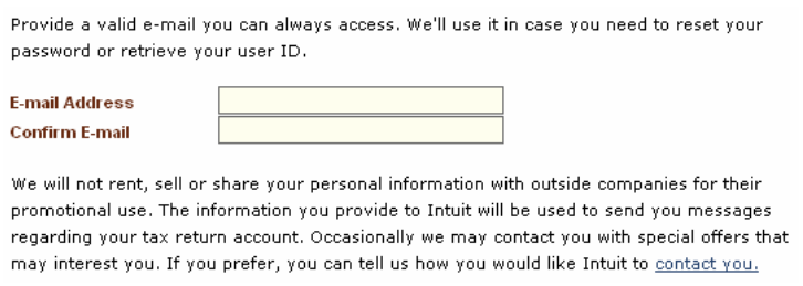
Figure 2: Intuit Registration Form

The Intuit registration form shown in Figure 2 discloses how they use the information and offers the option of opting-out of correspondences.