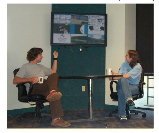
Figure 1: Two of the authors interacting with a mockup of the Speakeasy public display.

However, non-electronic public displays have several shortcomings. First, content cannot be added or modified remotely; in order to show her softball photograph on a non-electronic public display such as a bulletin board, Suzie would have to walk to the display itself and post a hardcopy. Similarly, it can also be difficult to update content; if there is a change in the softball game's date and time the poster will have to create entirely new fliers and manually replace all of the previously posted ones. Second, the display cannot be viewed remotely. If an individual sitting in his office remembers that he saw an interesting flyer on the cafeteria bulletin board, he has to walk from his office to the cafeteria to view the posting. Third, nonelectronic public displays provide limited on-site interaction with postings. If an individual would like more information about an upcoming event, she has to write down the contact information and remember to email the organizer later. Finally, because of the physical size limitations of non-electronic public displays, there is a maximum number of items which can be posted at any