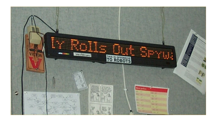
Figure 2: The Speakeasy tickertape LED sign scrolling a Slashdot headline.

combinations would be randomly selected (combinations of red, green, and orange).